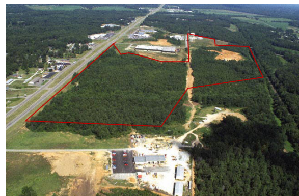
Henderson Industrial Park 150 acres

Visit www.wtia.org for the latest listing of industrial buildings and acreage for sale and/or lease.